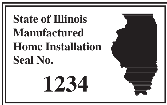
Example of Installation Seal

For each $50 installation fee the Department receives, it provides the installer a manufactured home installation seal and an Illinois manufactured home installation compliance certificate. The seal is to be placed above the red HUD label located on the exterior of each home after the home is installed. It has a unique number that will allow the Department to determine the responsible installer. The certificate provides the Department with information regarding the location of the home, date of installation, and the name of the owner, dealer and manufacturer of the home. One of the four copies of this form is to be returned to the Department within 30 days, with a copy provided to the homeowner and to the dealer. Seals and certificates can only be purchased by request from a licensed manufactured home installer. Several seals and certificates can be ordered at one time.